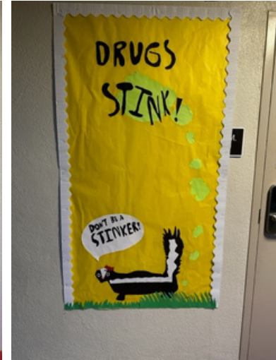
RED RIBBON WEEK DOOR CONTEST

Thank you to SCOE and Holiday Market for the donation to our school!